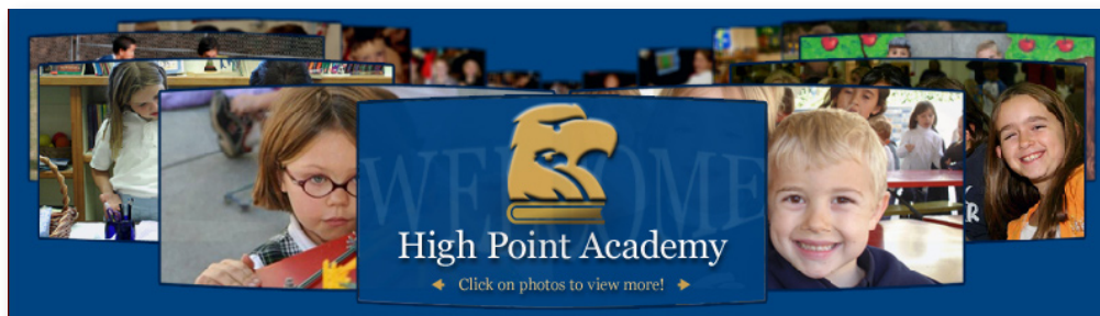
PHOTO GALLERIES. Additional pages throughout the site also feature flash photo galleries. These photos can be viewed by clicking a grey arrow at the bottom of the black frame, and scrolling through one by one.

THE CAROUSEL. The photo carousel on the home page of the site is a feature of the new look and feel. The carousel displays exciting and interactive photos that will take you through the lives of High Point Academy students and faculty. It's easy to use - to view more photos simply click on one of the smaller images to the left or the right of the center graphic.